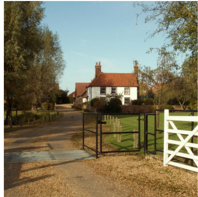
The entrance to Kitchen Hall Farm

www.designcouncil.org.uk/resources/guide/design-reviewprinciples-and-practice