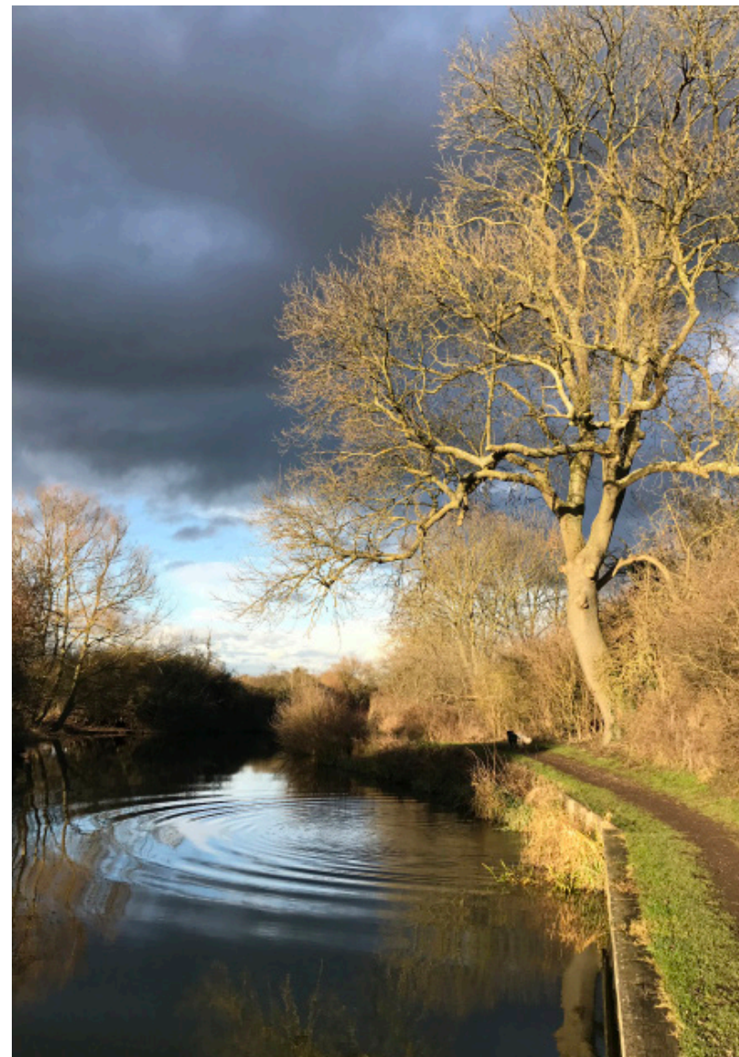
River Stort