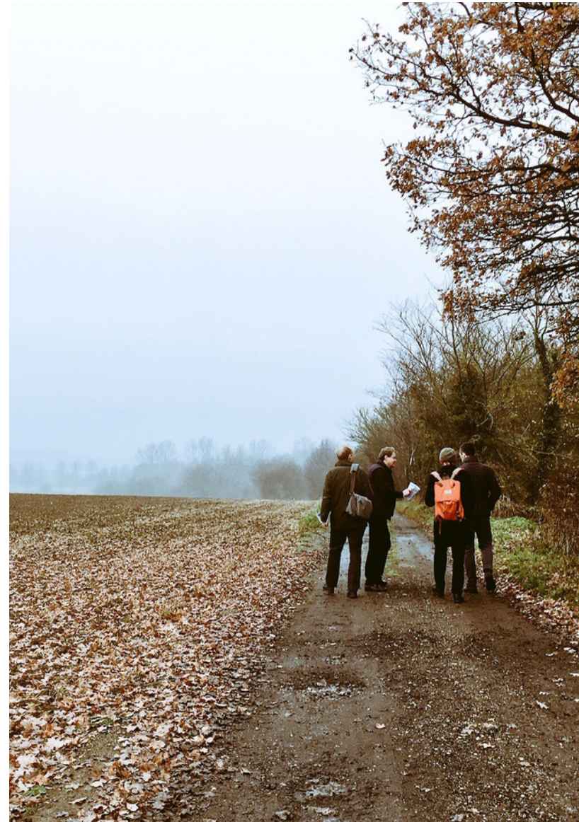
Panel site visit

From time to time, it may be of benefit for specialist advice to be provided beyond the Quality Review Panel membership. In such cases, a professional with the relevant expertise may be invited to attend a review meeting, participating in the discussion with the status of an adviser to the panel.