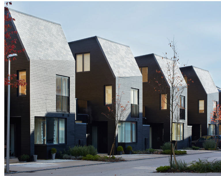
Newhall Be, Harlow, Alison Brooks Architects RIBA National Award 2013 - Housing Design Awards 2013

As public authorities the Councils are subject to the Freedom of Information Act 2000 (the Act). All requests made to the Councils (Harlow Council, Epping Forest District Council and East Herts District Council) for information with regard to the Harlow and Gilston Quality Review Panel will be handled according to the provisions of the Act. Legal advice may be required on a case by case basis to establish whether any exemptions apply under the Act.