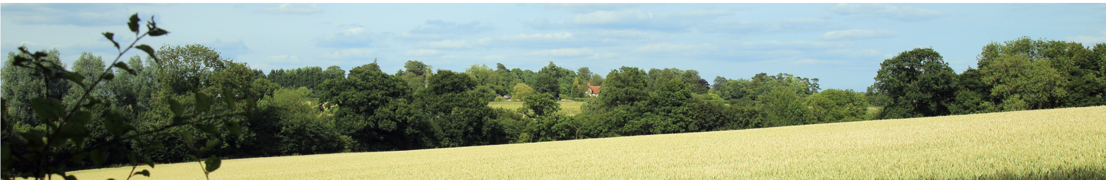
A view East from Gibberd Garden, Essex

Large projects, for example schemes with several development plots, may be split into smaller elements for the purposes of review to ensure that each component receives adequate time for discussion.