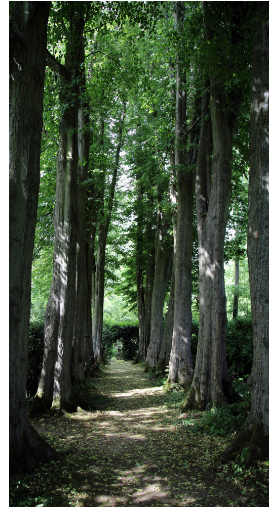
Gibberd Garden, Essex

To help ensure that these aspirations are fulfilled, the Councils have established a Quality Review Panel – to provide 'critical friend' advice and design guidance to support the delivery of strategic sites in Harlow and Gilston Garden Town.