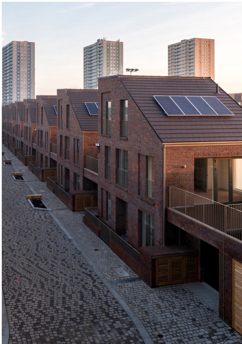
Dujardin Mews, Maccleanor Lavington and Karakusevic Carson Architects Civic Trust Award 2018 - RIBA National Award 2017